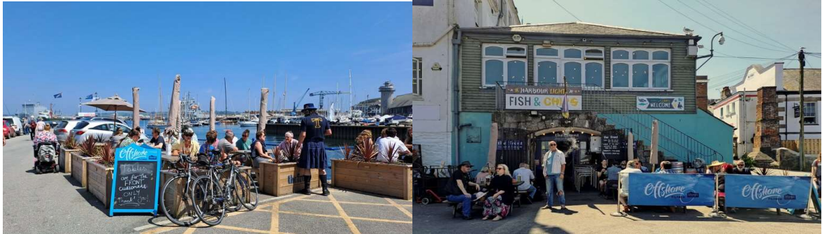
The Front.

We will be hosting ECR networking opportunities in Falmouth on an evening, or you can simply relax in one of the many restaurants or pubs on the Fal waterfront on an evening while watching out for interesting boats and wildlife. More information to come soon!