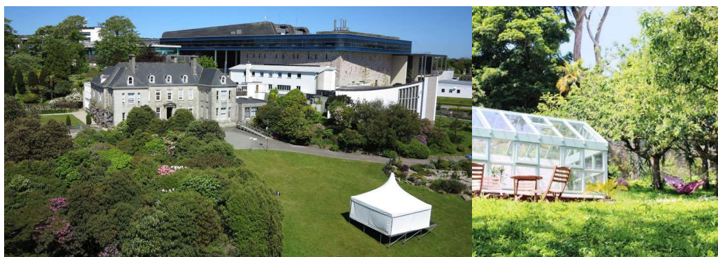
Views of historic Tremough House and the walled garden, complete with hammocks.

The Penryn campus has a long history with the site originally being a landed estate, with records dating back to 1309. After centuries of ownership and expansion by multiple families, the property was transformed into a convent school in the mid-20 th century, before becoming a university campus in the late 20 th century. The campus retains several historical features including the lime tree avenue (once a grand entrance to the estate), a walled garden and other beautiful areas. We will conduct a short walking tour on the first day to acquaint you with the campus, and (weather dependent!) we will maximise time outside by taking lunches in the gardens.