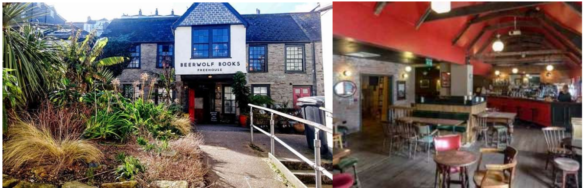
Beerwolf Books and Freehouse.