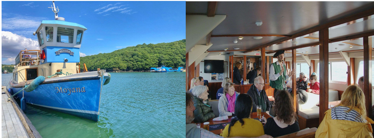
Our craft for the afternoon: The Moyana with its spacious outside and inside seating areas (pirate not included).

*Extra cost, prices will be made available soon with discounts for ECRs.