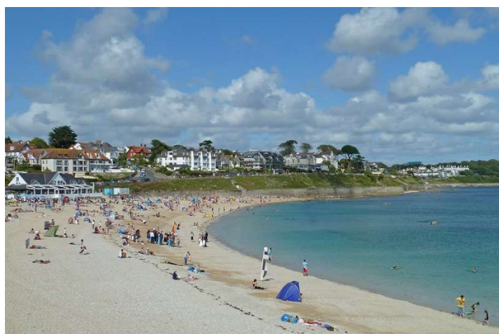
A view of Falmouth with Gylly beach in the foreground and Castle beach in the background.

Falmouth has several beaches and sea swimming and rock pooling is popular at Gyllyngvase 'Gylly' and Castle Beaches, accessible from central Falmouth by a short walk. Morning (optional!) sea swims will be organised for enthusiastic delegates, as will campus or Falmouth runs.